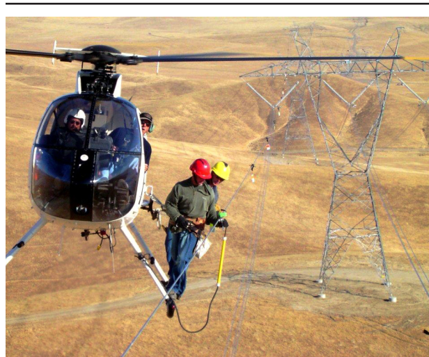
Installation by helicopter on existing power lines